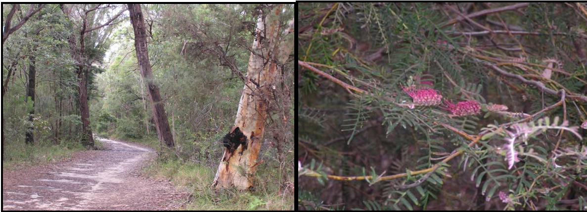
Above: Waking trail Duffys Forest. Right: Grevillea caleyi , a key shrub species of the Duffys Forest plant community